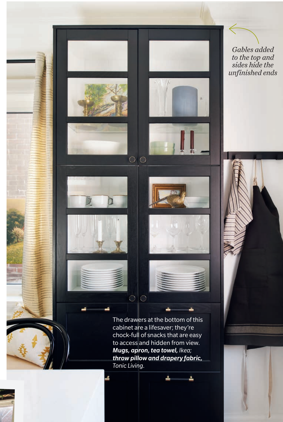
Gables added to the top and sides hide the unfinished ends

THE ABSOLUTE MUST-HAVE Having a long, narrow island was my first priority. I wanted a place where all three boys could gather to hang out or dine. Now we have a nice, long surface with no cooktop or sink in the way — perfect for entertaining. Euan is a bit of a chef (lucky me), and he and I are often cooking together on the working side of the island while the twins perch on the stools awaiting his creations. When your kitchen looks good but also functions for everyone, it's a huge victory.