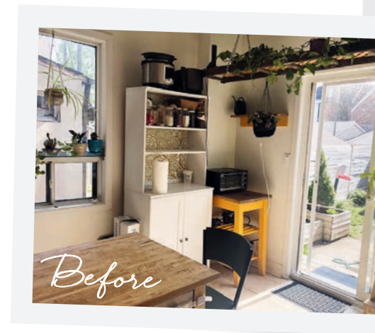
Produced by Stacy Begg / Floor plan illustration by Madison Pflance

The drawers at the bottom of this cabinet are a lifesaver; they're chock-full of snacks that are easy to access and hidden from view. Mugs, apron, tea towel, Ikea; throw pillow and drapery fabric, Tonic Living.