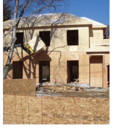
It takes some imagination to picture the finished house. At the moment it's just a plywood box, but soon enough, the exterior cladding, custom windows, applied to a stucco finish. Victor (our shutters, doors and beautiful landscaping will transform it into the polished vision shown above.